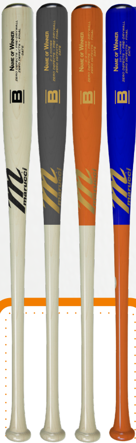
HOME RUN AWARD

Any Builder who completes a Burgess Pre-Drywall and Final inspection on the same address AND passes both inspections with zero defects will receive a custom engraved, full-sized Marucci bat. As the number of qualifying homes increases, a higher level and different color bat will be awarded.